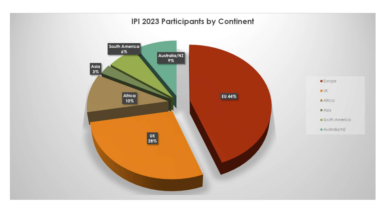
Figure 1: Participants by continent IPI2023